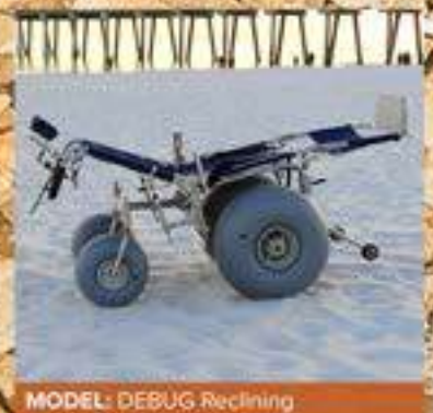
MODEL: DEBUG Reclining