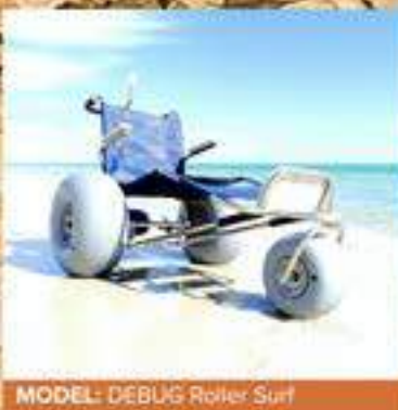
MODEL: DEBUG Roller Surf